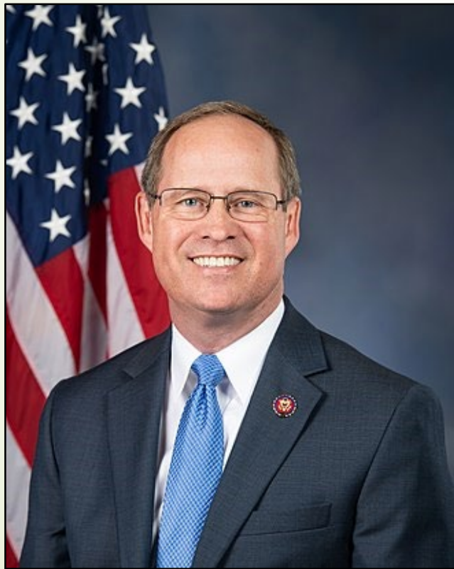
Rep. Greg Murphy 3 rd NC District

The Commission and Towns of Topsail Island thank our two Congressional Representatives for spending their time with us to tour the island and learn of our successes and challenges to come.