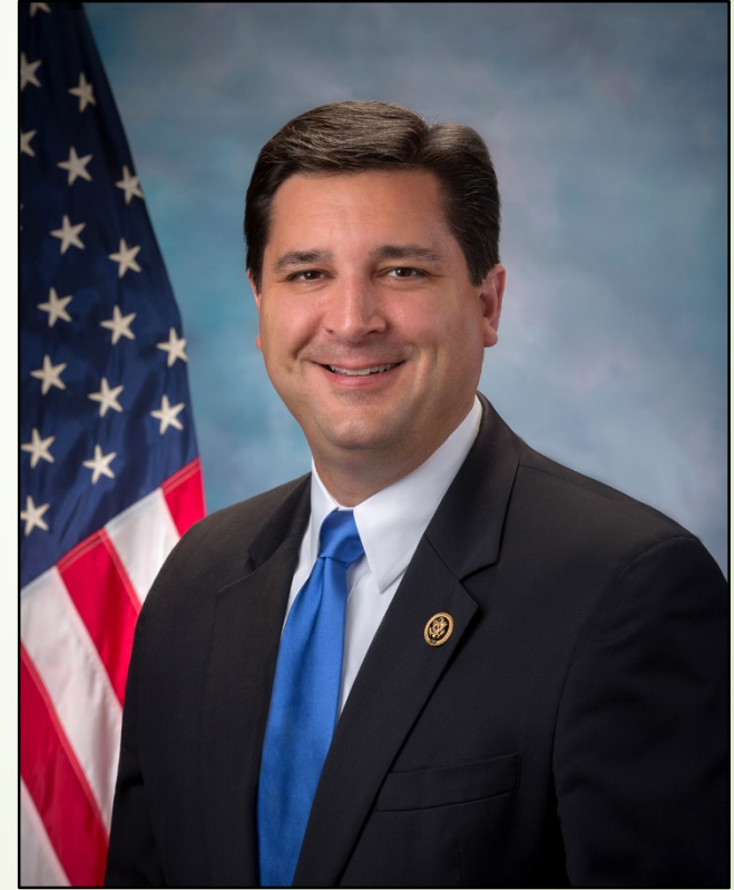
Rep. David Rouzer 7 th NC District