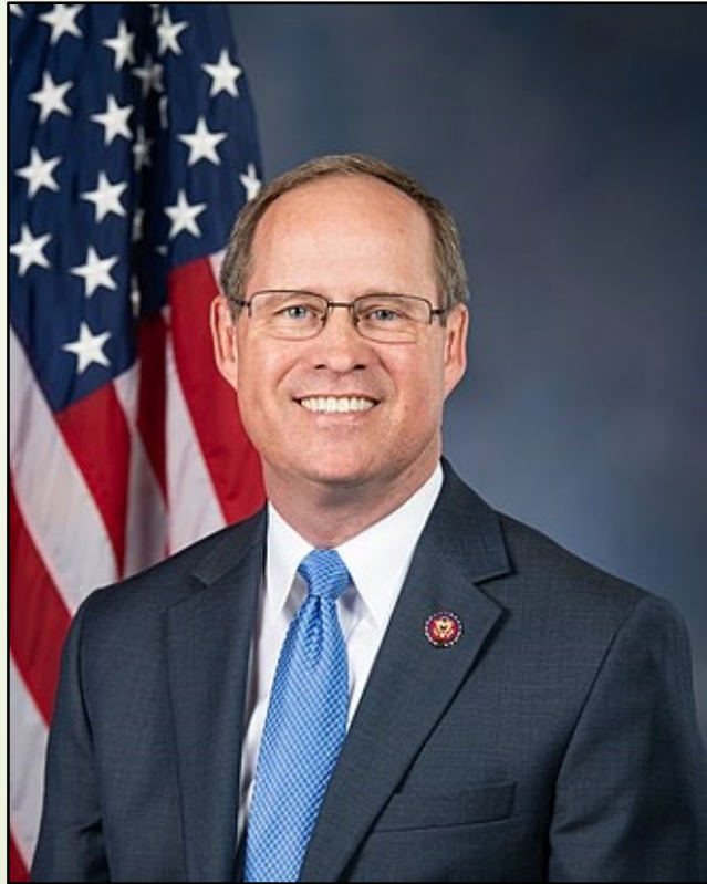
Rep. Greg Murphy 3 rd NC District