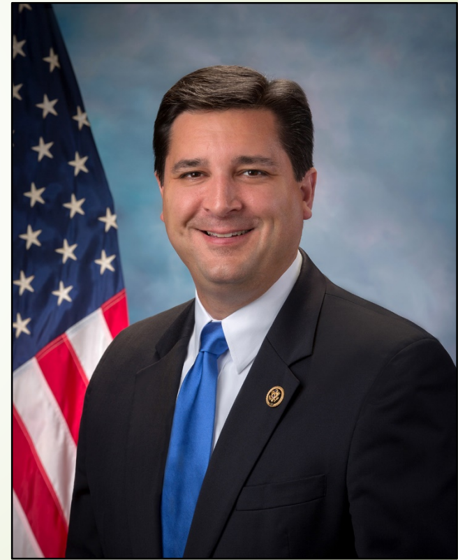
Rep. David Rouzer 7 th NC District